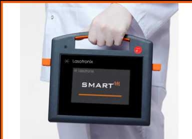
Lightweight and portable (2.5 kg)