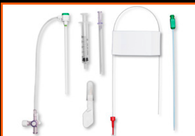
Introducer Set for fibers